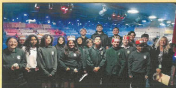
To follow up with a curriculum course on Medieval Europe, the seventh grade class attended Medieval Times in Orange County.