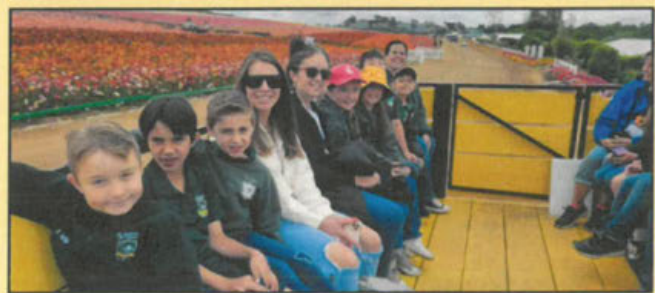
The second grade class enjoyed the Carlsbad Flower Fields and followed up with an art class learning how to sketch and paint water color Ranunculus flowers.

FAITH-FILLED * COMMUNICATOR * CONFIDENT * LIFELONG LEARNER