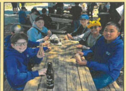
Sixth grade students recently returned from a week's long trip at Lake Cuyamaca Camp.