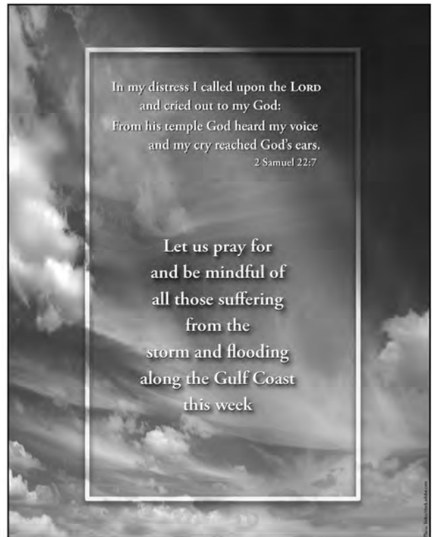
Scripture text: From the New American Bible © Confraternity of Christian Doctrine, Inc., Washington, DC - Used with permission. All rights reserved. Compliments of J.S. Paluch Company

If you've ever had an unpleasant but somewhat amusing practical joke played on you, then you have some understanding of how Jeremiah feels today when he tells God "good one--you duped me." We can almost see him shaking his head with a bit of a rueful smile, but an angry undertone in his voice. In similar fashion, Peter thinks Jesus is "duping" him when Jesus starts to explain that being Messiah means suffering and dying, and being a follower of the Messiah means taking up a cross and doing the same. Jeremiah tries to deny God's will for him by trying to shut up; Peter--who has just been made the foundation of the church--out and out denies the teaching of Jesus, for which he is named "Satan" today. Fortunately for us, Jeremiah comes to realize that to have the word of God placed in your heart means that it will be futile to try and keep silent, even if it means scorn and derision from those around you. Luckily Peter ultimately returned to the faith he professed in last week's Gospel, and came to understand our need as baptized followers of Christ to follow in his way, even when it means following him to our very death. Copyright (c) J. S. Paluch Co., Inc.